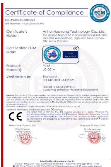
Example of non compliant document

If you are still uncertain, please feel free to contact the team at BSIF either by calling 01442 248744 or emailing enquiries@bsif.co.uk and we will do our best to help.