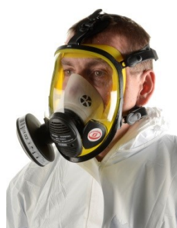
Figure 3 Full-face mask