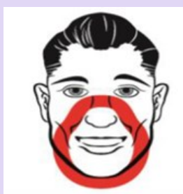
Figure 4: Example showing the face seal region (underneath the red line) that must be clean shaven for a half mask or Filtering Face Piece (FFP)

Research carried out by the HSE has demonstrated that protection could be significantly reduced where stubble or facial hair was present in the seal area. 11