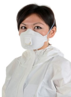
Figure 1 Disposable half mask