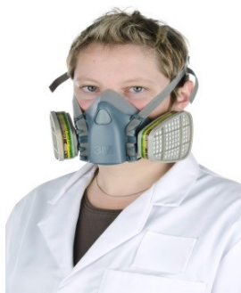
Figure 2 Reusable half mask