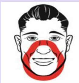
Figure 5: Example showing the face seal region (underneath the red line) that must be clean shaven for a half mask

Research carried out by the HSE has demonstrated that protection could be significantly reduced where stubble or facial hair was present in the seal area. 11