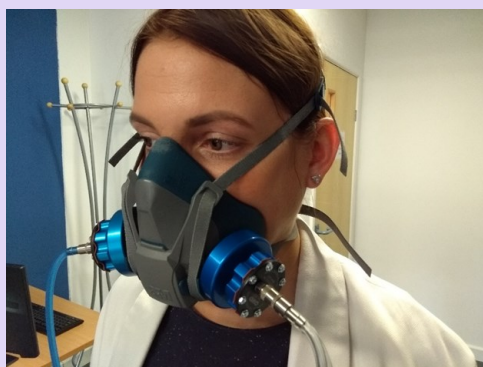
Figure 4. CNP adapters fitted to half mask during a CNP Fit Test

Should the measurement taken, following the end of an exercise, indicate a fail which the fit tester believes to have been caused as a result of something unrelated to the fit of the mask (eg failure of the wearer to hold their breath or indeed the wearer sneezing) the measurement can be taken one further time. The second measurement should be taken without delay and without further adjustment to the mask. If the second measurement indicates a pass, the fit test should then proceed to the next exercise or to the conclusion of the fit test should this second measurement have been after the final exercise.